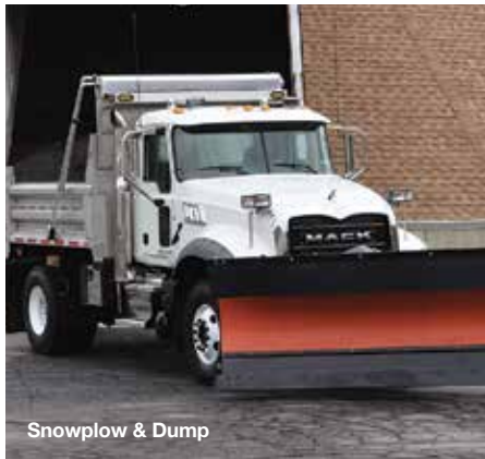
Snowplow & Dump

The Granite MHD's durable, galvanized steel cab is mounted on airbags and shocks, so you stay comfortable while your truck does all of the heavy lifting.