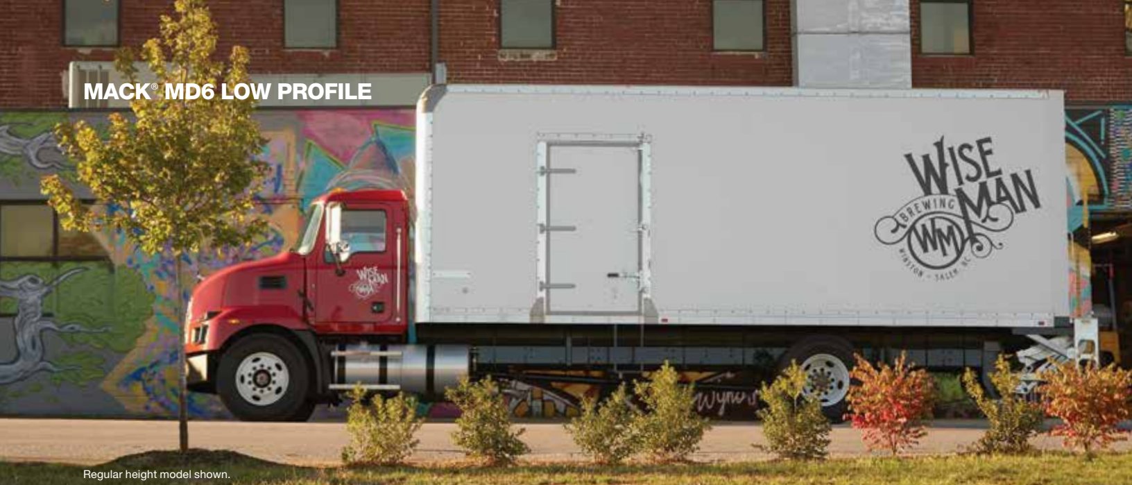
Regular height model shown.